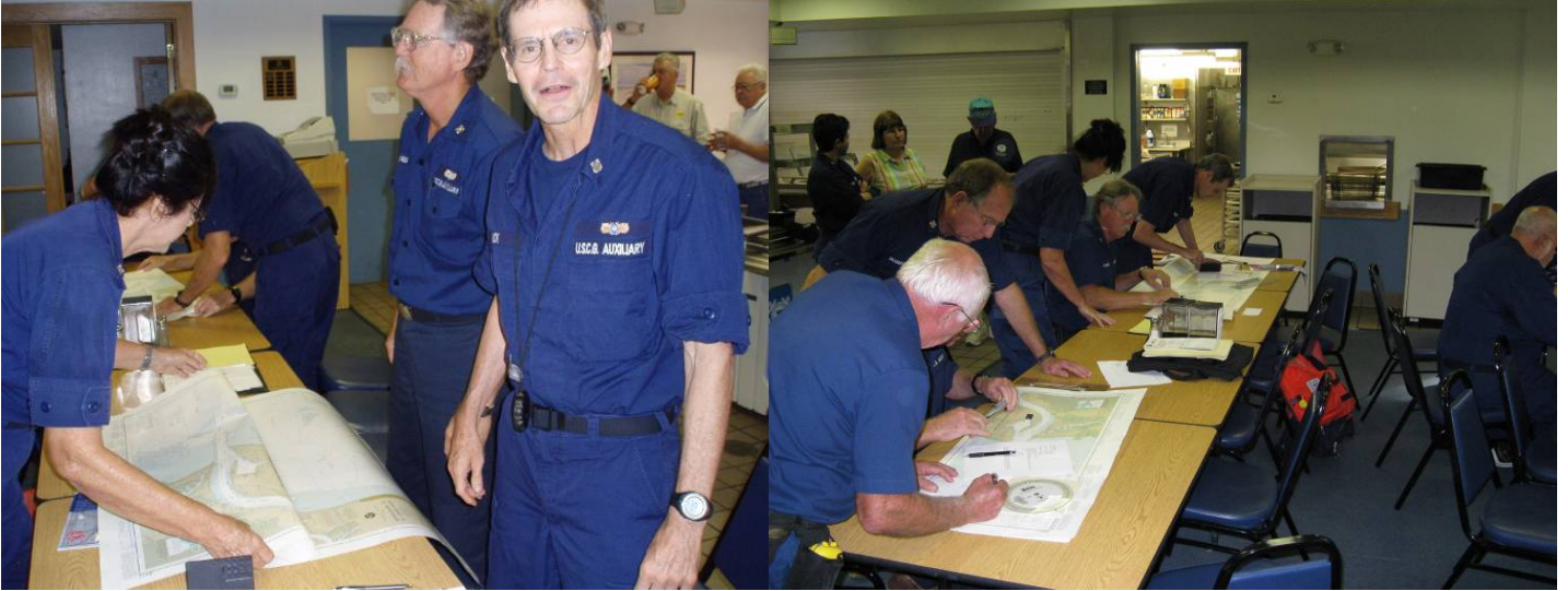
Crew teams race against time in Dead Reckoning by Plotting and Running a Course using Speed/Time/Distance.