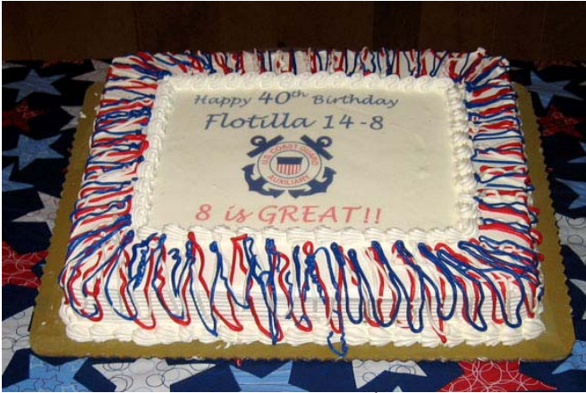
Cake for Flotilla 14-8 40 th Birthday