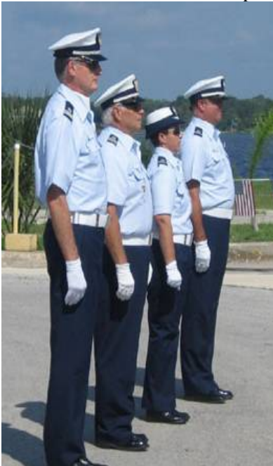
Division 14 Honor Guard