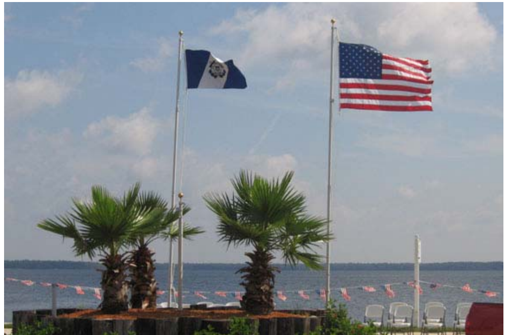
American and USCG Auxiliary flags flying high at the new Green Cove Springs Detachment