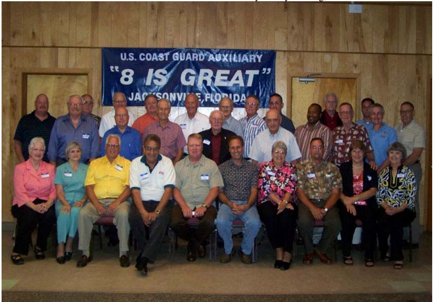
Both current and retired members along with their invited guest celebrated on Saturday, July 18 th Flotilla 14-8’s 40 th Birthday