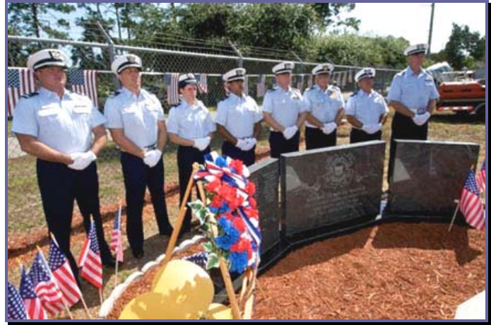
The Division 14 Honor Guard and the Wall