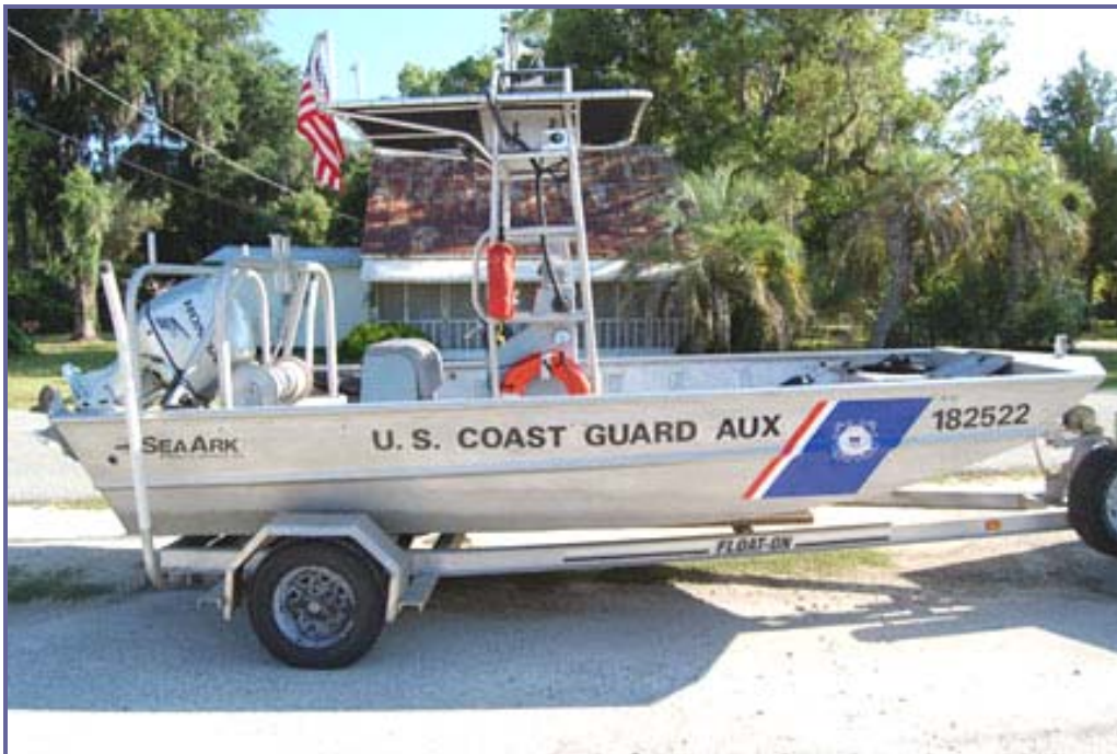
The 18 foot Coast Guard Boat to be used by TEAM WELAKA, ready for inspection