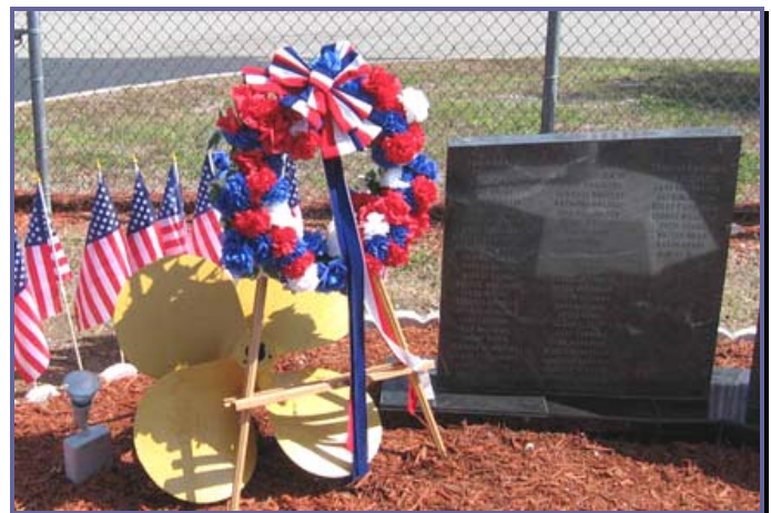
This portion of the Memorial Wall contains names of members of Division 14 who have crossed over the bar since the Division was established