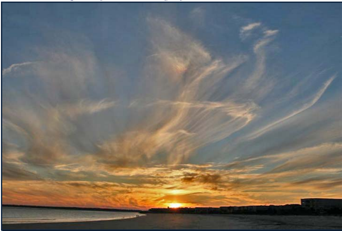
Whit Vick, Flotilla Commander shot this picture near Brunswick, Georgia

See photos from our Change of Watch inside this edition