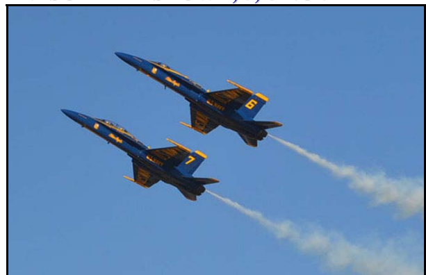
The Navy's Blue Angels salute the Centennial of Naval Aviation in the skies over the St. Johns River