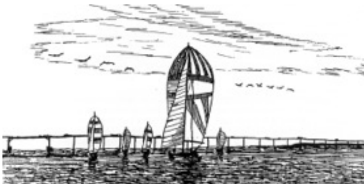
Hand drawing from the original Eight Bells newsletter