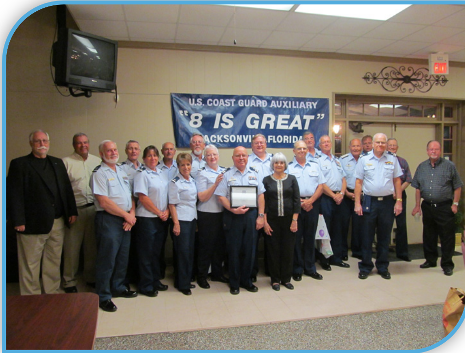
All 14-8 members present - both Active and Retired