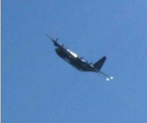
Overhead 14-8 OPFAC Tomcat, Blue Angels' Fat Albert