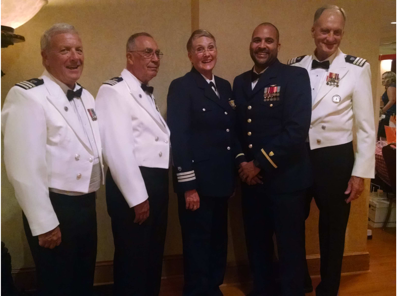
Looking their finest at DTRAIN 2016